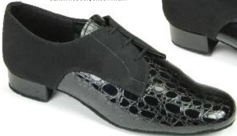
GIBSON DUO BLACK NUBUCK/CROC PATENT