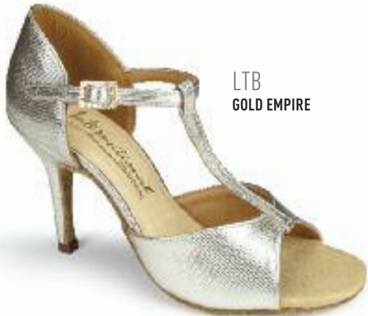
LTB GOLD EMPIRE