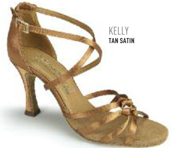
KELLY TAN SATIN