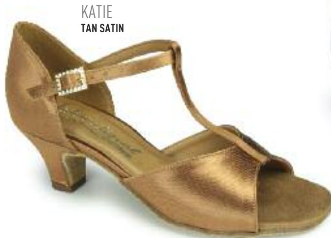
KATIE TAN SATIN