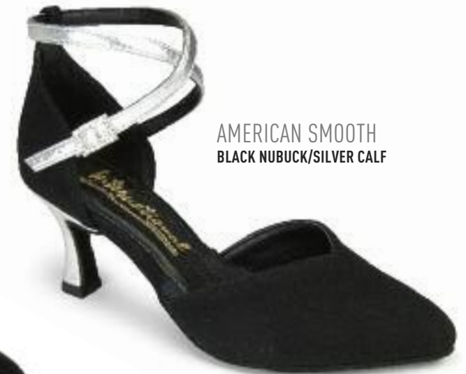
AMERICAN SMOOTH BLACK NUBUCK/SILVER CALF