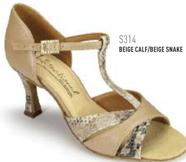
S314 BEIGE CALF/BEIGE SNAKE