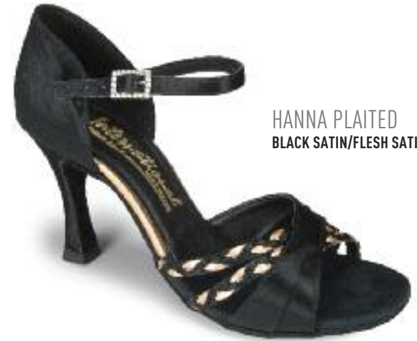
HANNA PLAITED BLACK SATIN/FLESH SATIN