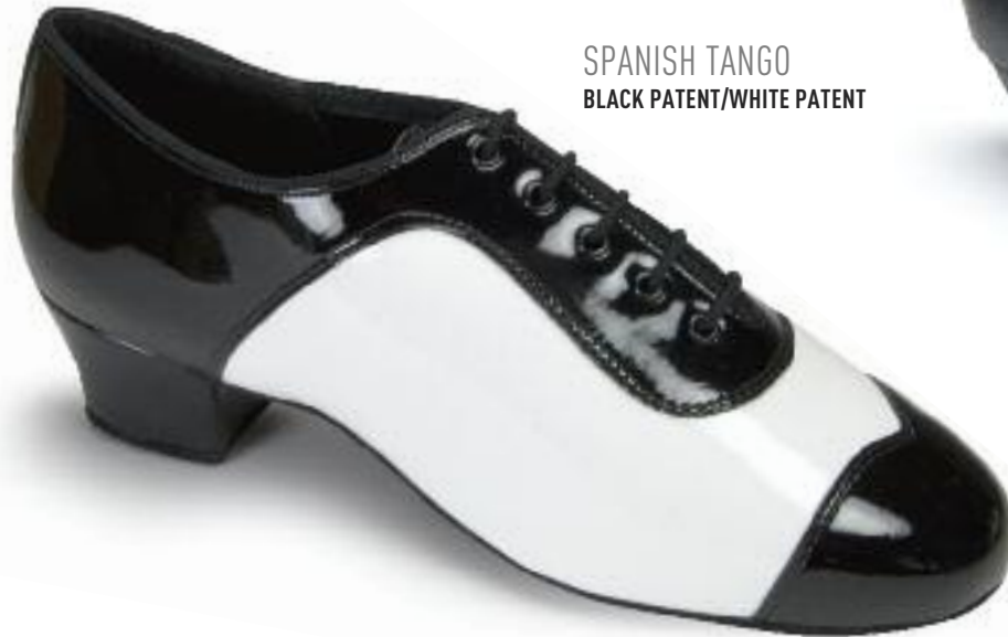
SPANISH TANGO BLACK PATENT/WHITE PATENT