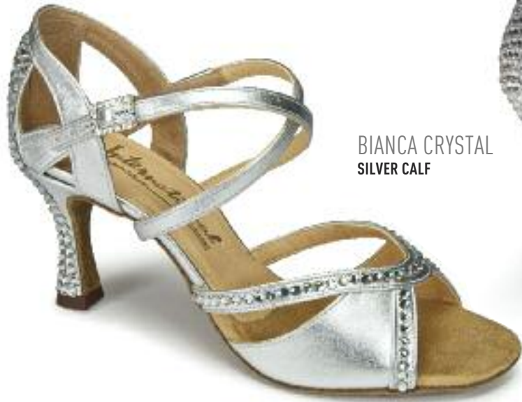
BIANCA CRYSTAL SILVER CALF