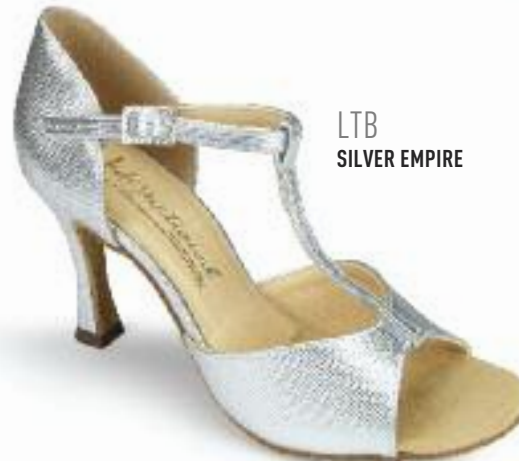
LTB SILVER EMPIRE