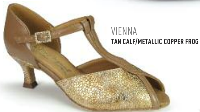
VIENNA TAN CALF/METALLIC COPPER FROG