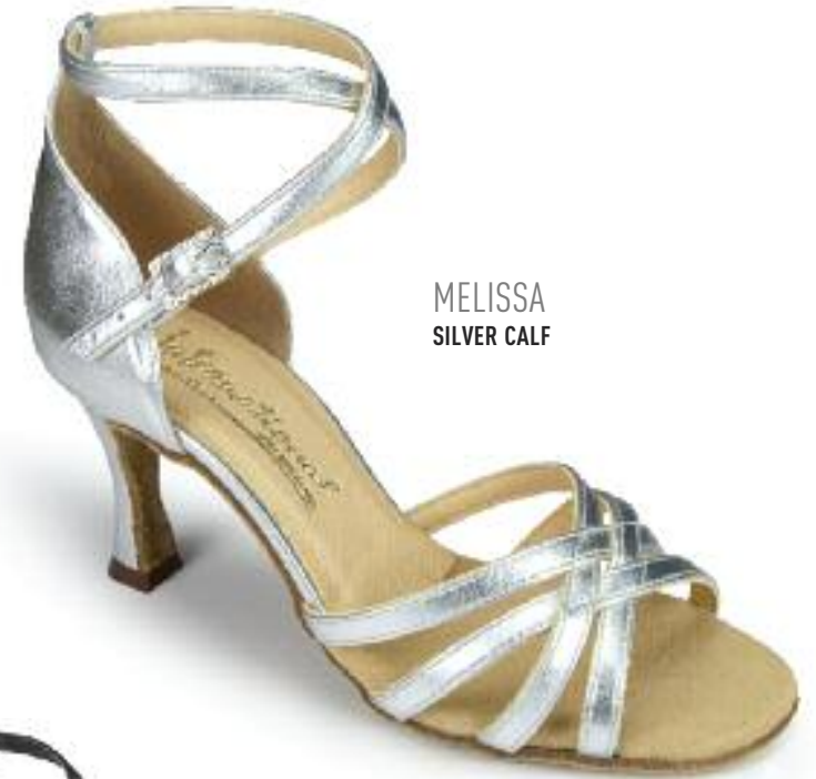
MELISSA SILVER CALF