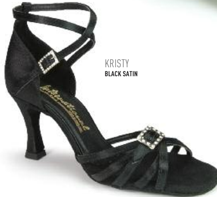
KRISTY BLACK SATIN