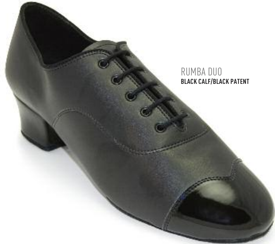
RUMBA DUO BLACK CALF/BLACK PATENT