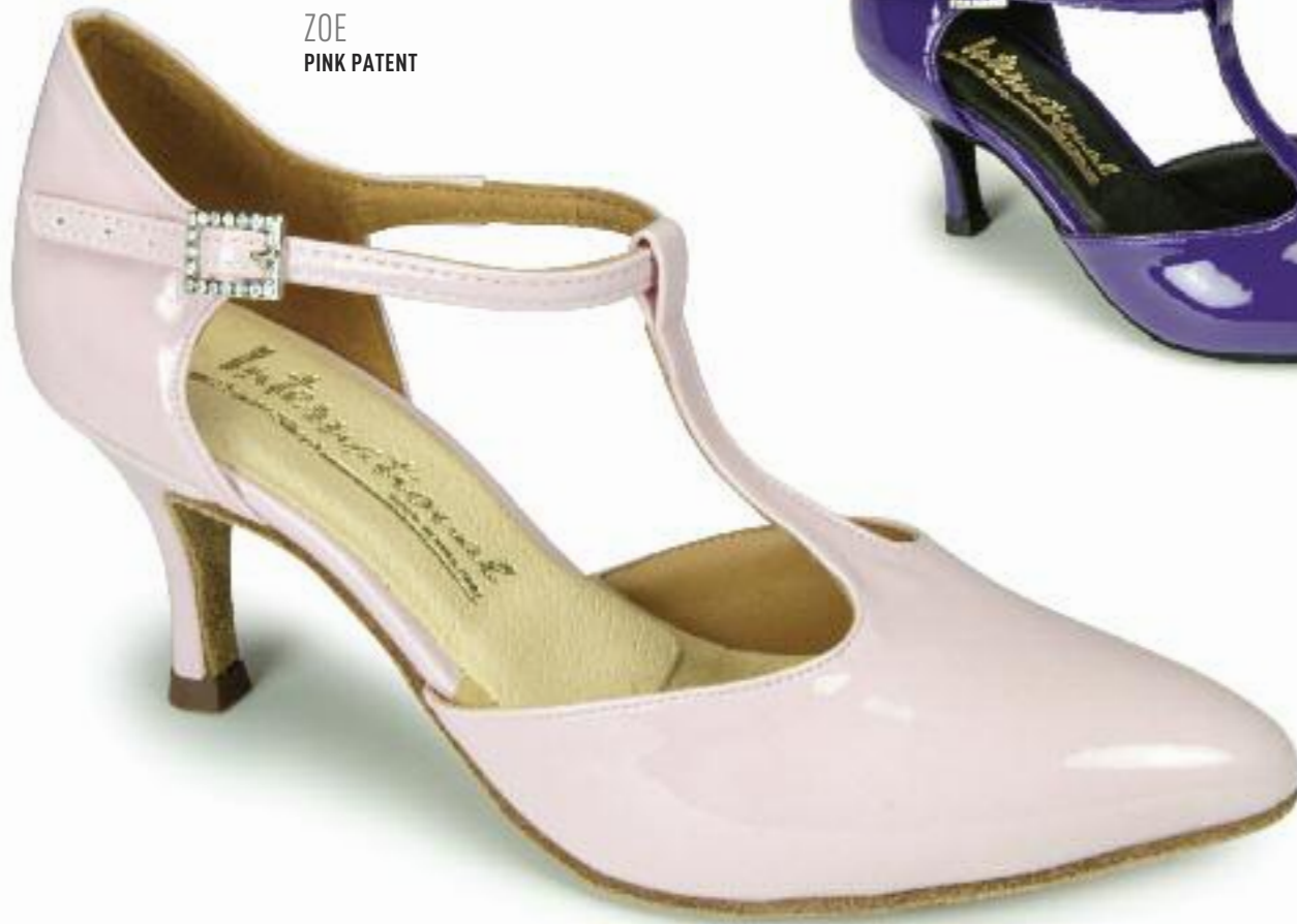
ZOE PINK PATENT