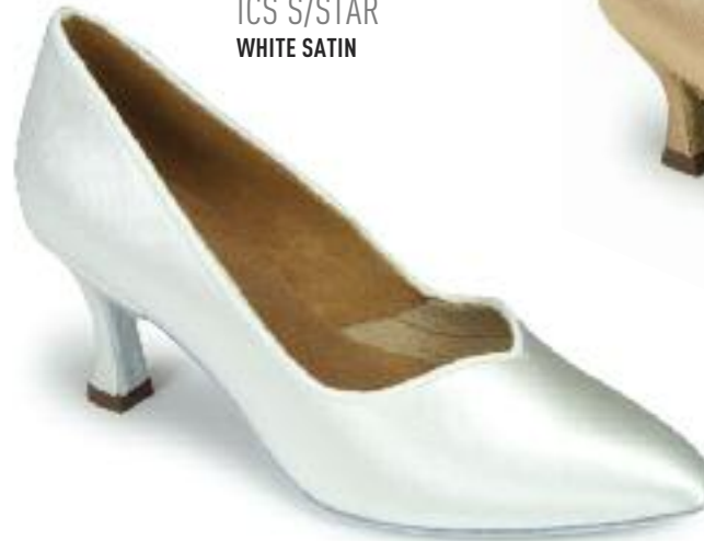
ICS S/STAR WHITE SATIN