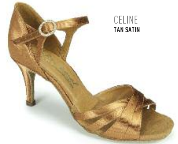
CELINE TAN SATIN