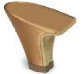
2" SPANISH LADIES