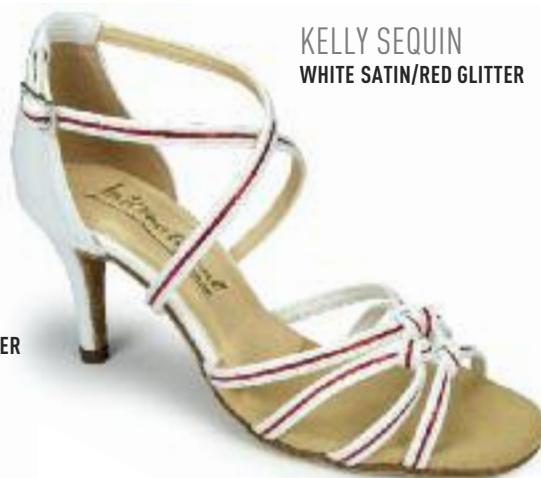
KELLY SEQUIN WHITE SATIN/RED GLITTER