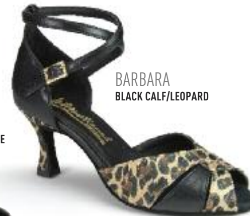
BARBARA BLACK CALF/LEOPARD