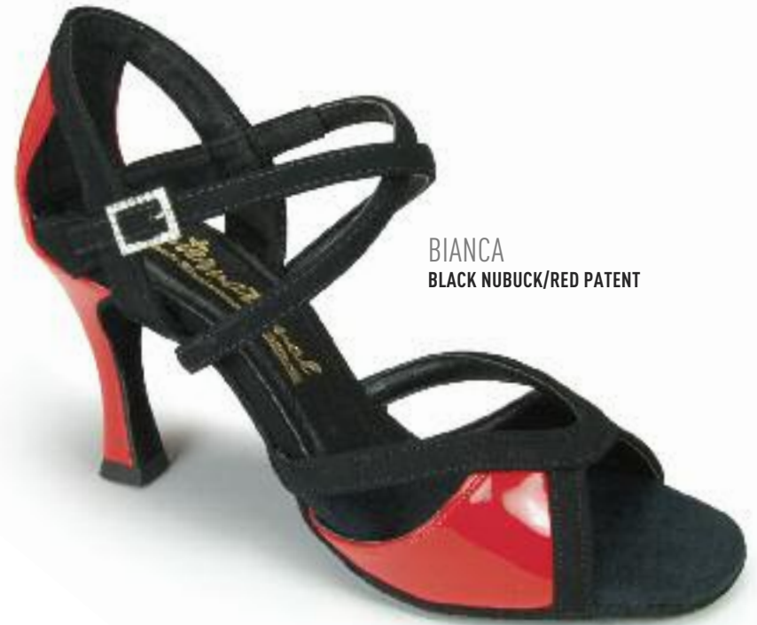
BIANCA BLACK NUBUCK/RED PATENT