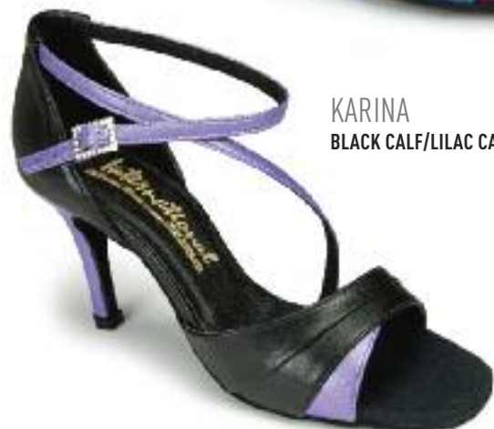
KARINA BLACK CALF/LILAC CALF