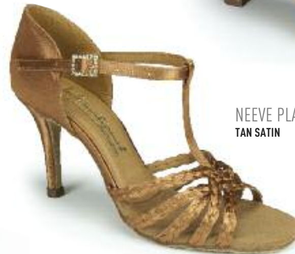
NEEVE PLAITED TAN SATIN