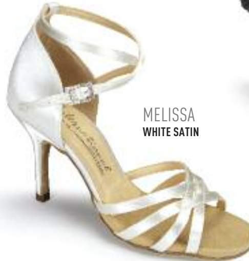
MELISSA WHITE SATIN