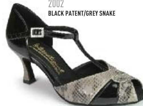
2002 BLACK PATENT/GREY SNAKE