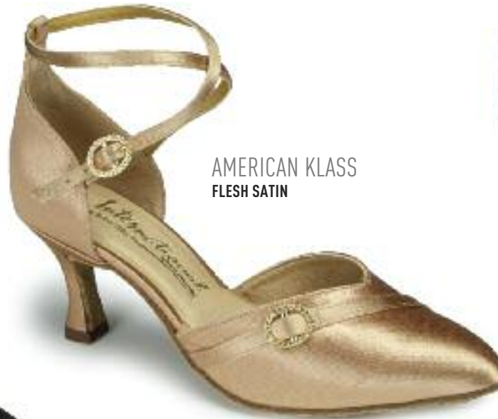
AMERICAN KLASS FLESH SATIN