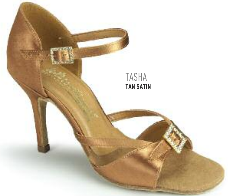
TASHA TAN SATIN