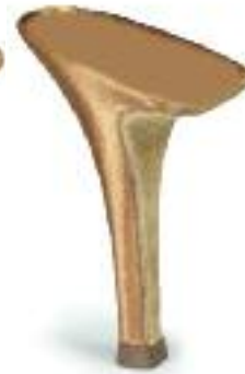
3" ULTRA SLIM