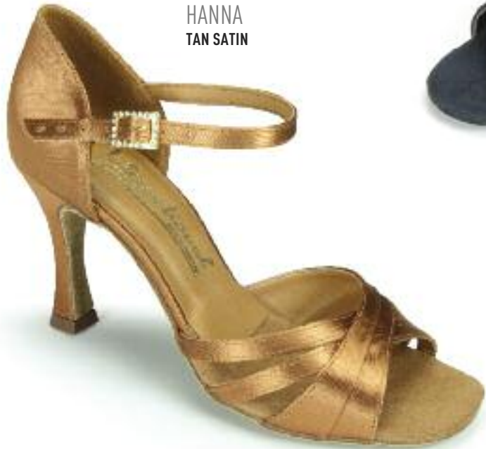
HANNA TAN SATIN