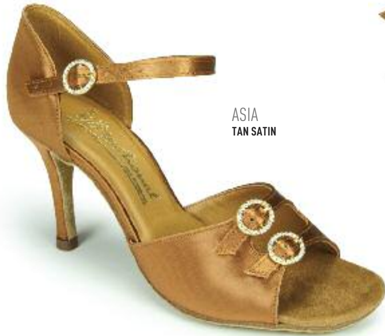
ASIA TAN SATIN