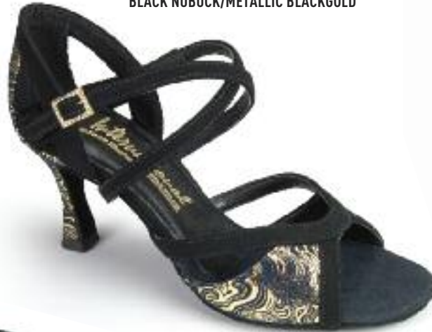
BIANCA BLACK NUBUCK/METALLIC BLACKGOLD