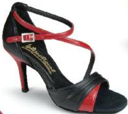
KARINA BLACK CALF/RED CALF