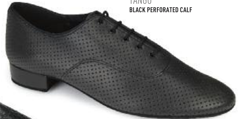
TANGO BLACK PERFORATED CALF