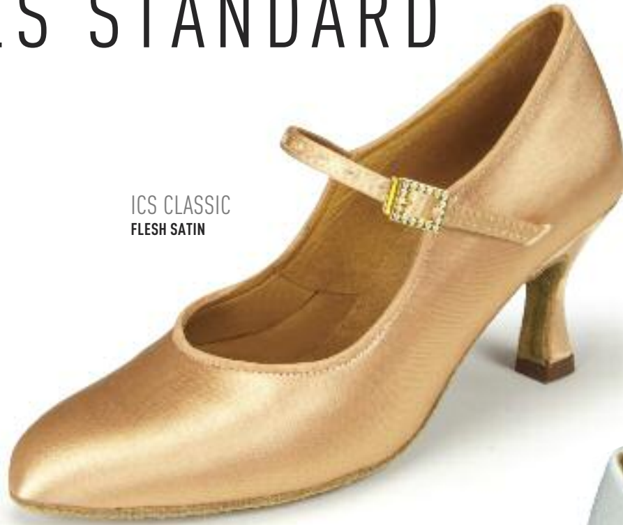
ICS CLASSIC FLESH SATIN