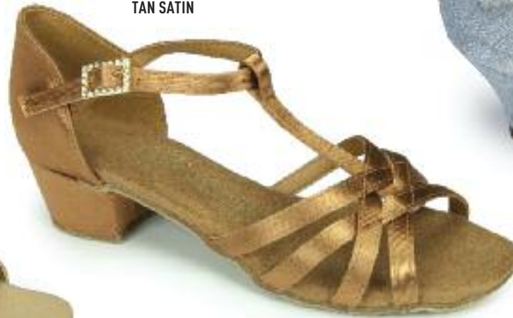
MELISSA T-BAR TAN SATIN