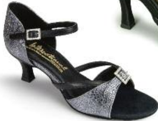
TASHA GUNMETAL FROG/BLACK CALF