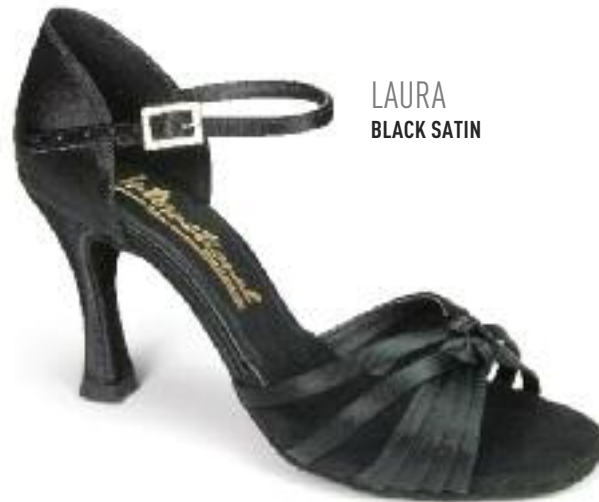
LAURA BLACK SATIN