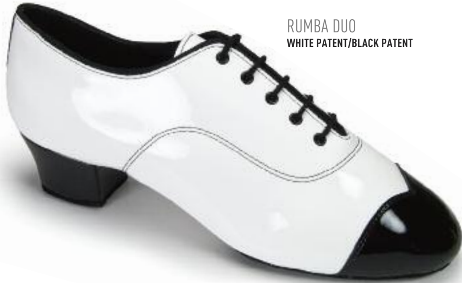
RUMBA DUO WHITE PATENT/BLACK PATENT