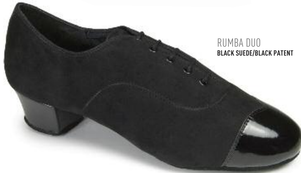
RUMBA DUO BLACK SUEDE/BLACK PATENT