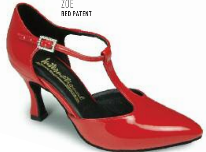
ZOE RED PATENT