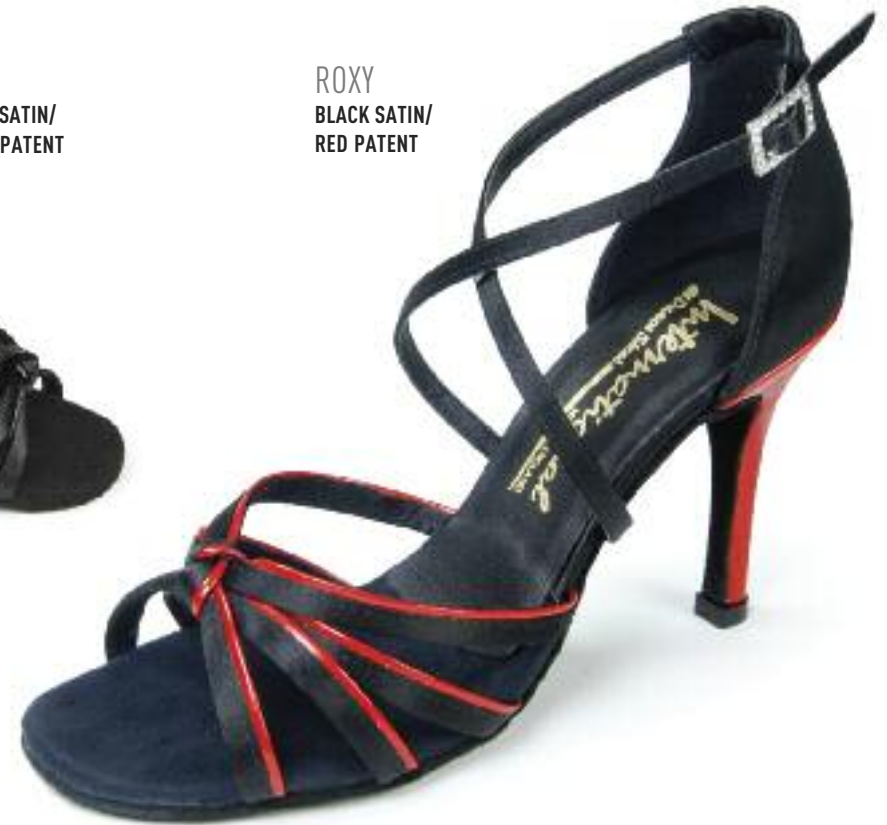
ROXY BLACK SATIN/ RED PATENT