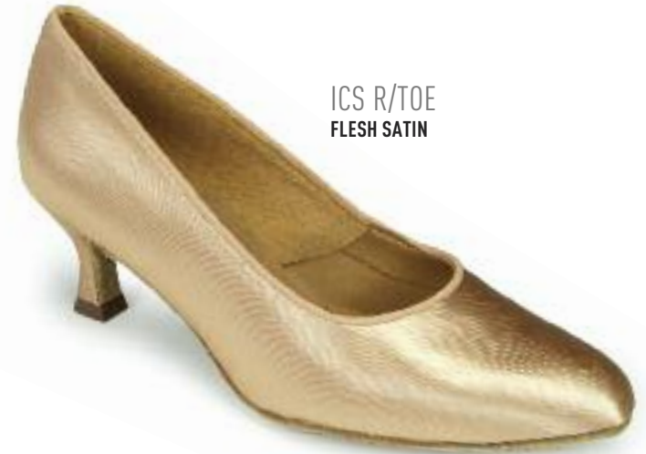
ICS R/TOE FLESH SATIN