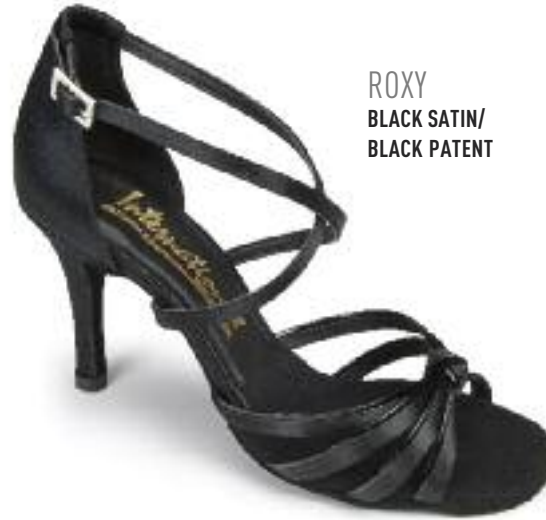
ROXY BLACK SATIN/ BLACK PATENT