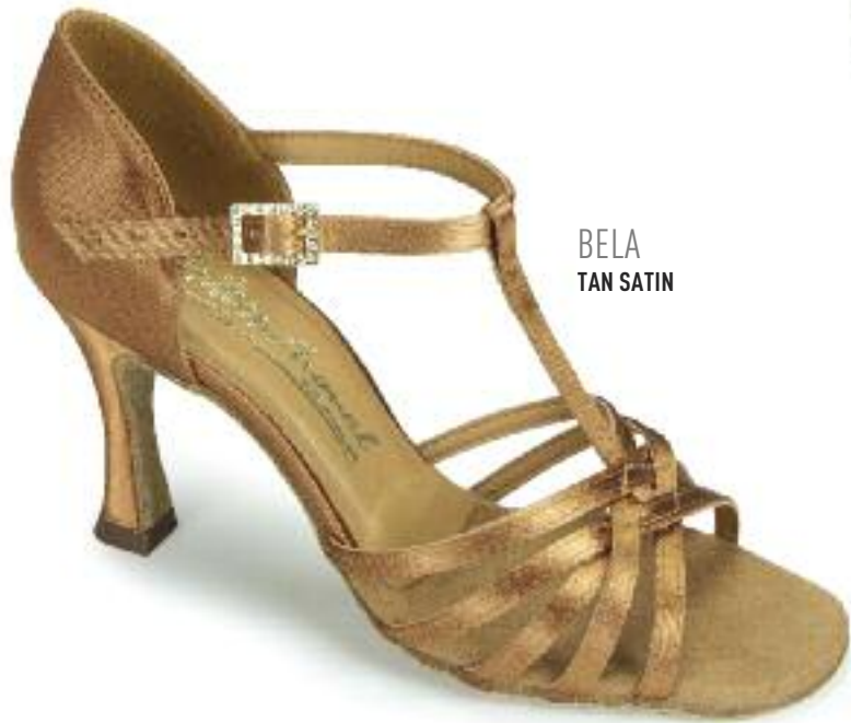
BELA TAN SATIN