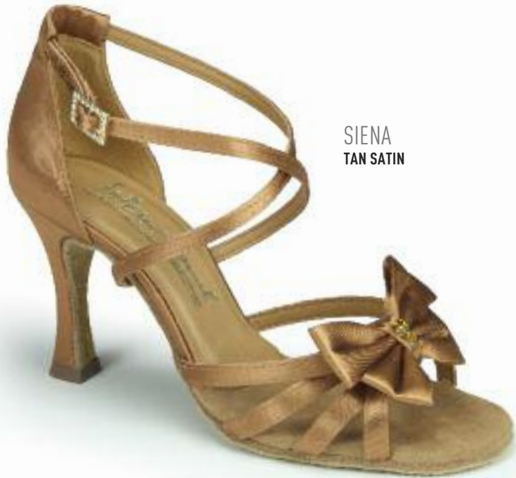
SIENA TAN SATIN