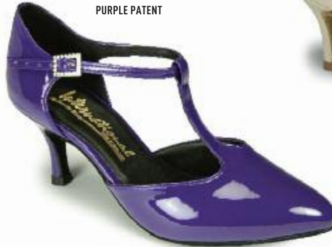
ZOE PURPLE PATENT