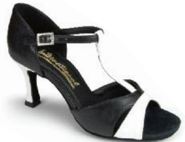
C315 BLACK CALF/WHITE CALF