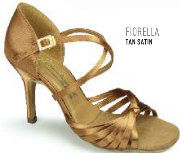
FIORELLA TAN SATIN