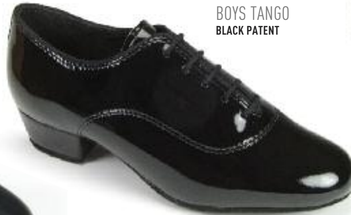
BOYS TANGO BLACK PATENT