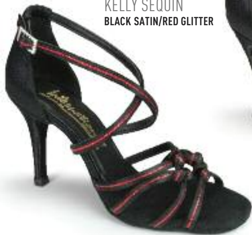
KELLY SEQUIN BLACK SATIN/RED GLITTER