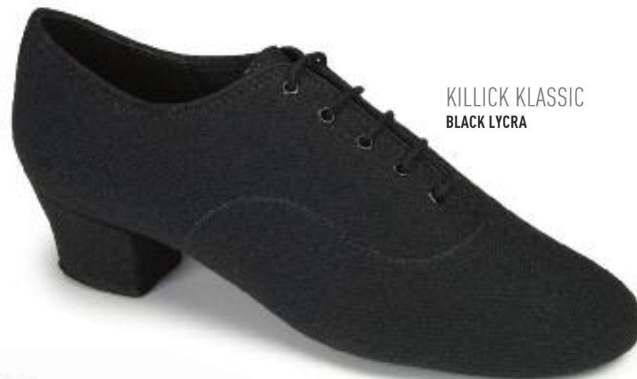
KILLICK KLASSIC BLACK LYCRA