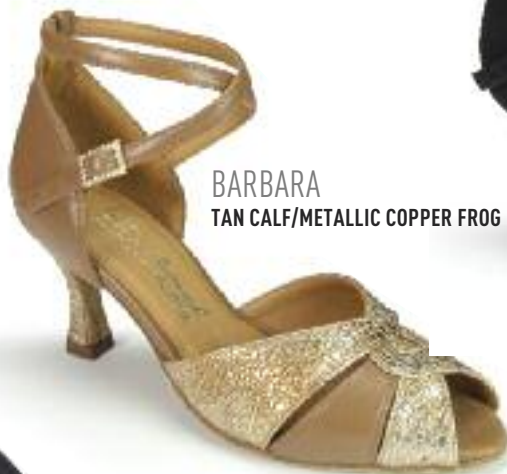
BARBARA TAN CALF/METALLIC COPPER FROG