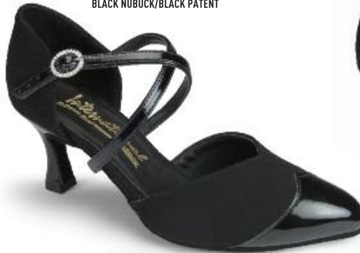
2008 BLACK NUBUCK/BLACK PATENT