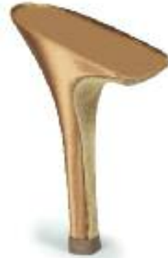
3½" ULTRA SLIM