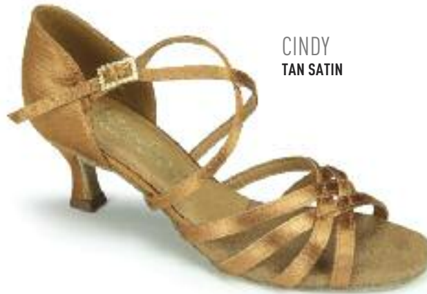
CINDY TAN SATIN