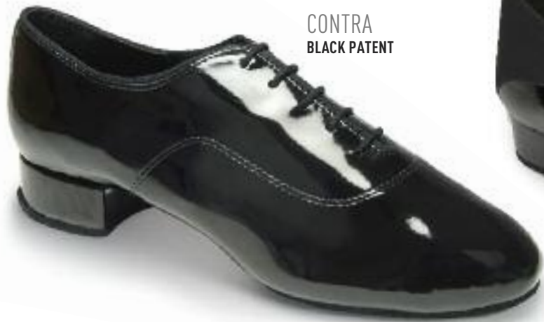
CONTRA BLACK PATENT