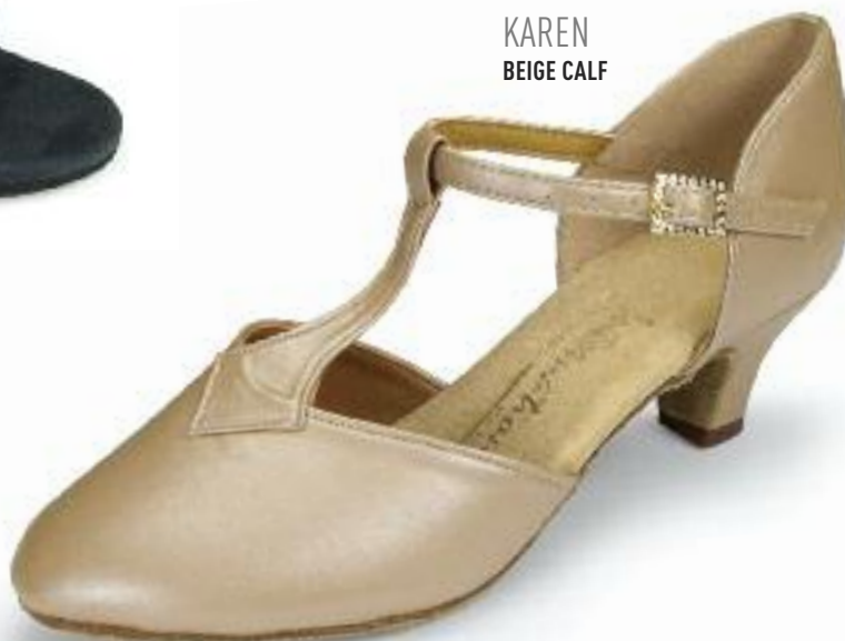
KAREN BEIGE CALF