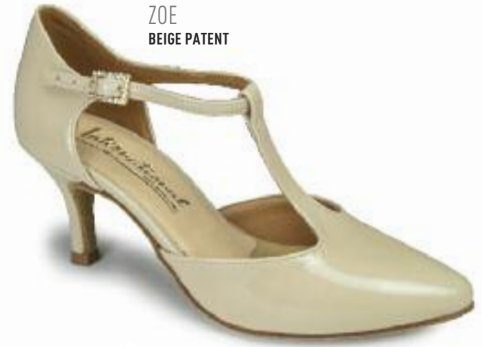
ZOE BEIGE PATENT