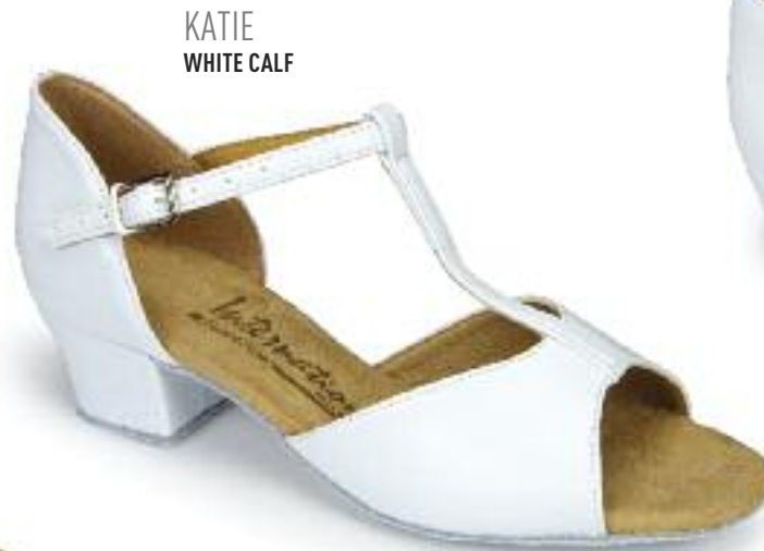
KATIE WHITE CALF