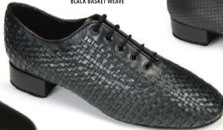
TANGO BLACK BASKET WEAVE