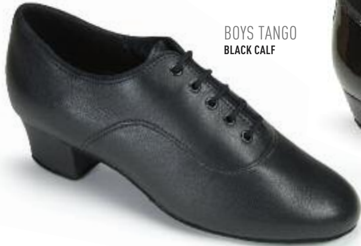
BOYS TANGO BLACK CALF