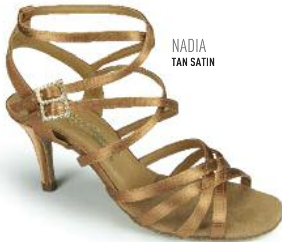
NADIA TAN SATIN