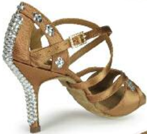
BIANCA CRYSTAL TAN SATIN