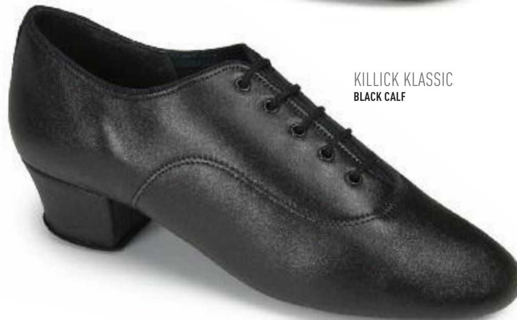
KILLICK KLASSIC BLACK CALF