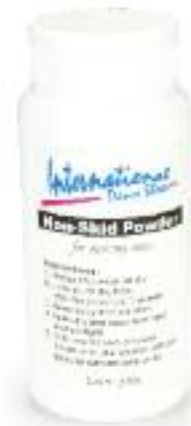
NON SKID POWDER