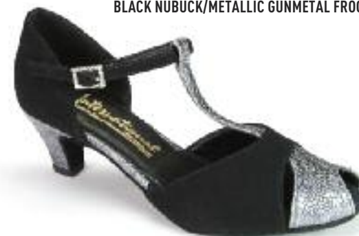
WENDY BLACK NUBUCK/METALLIC GUNMETAL FROG