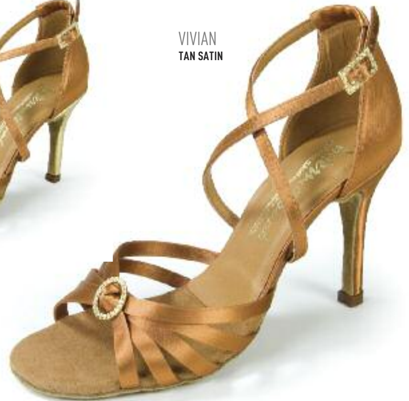
VIVIAN TAN SATIN