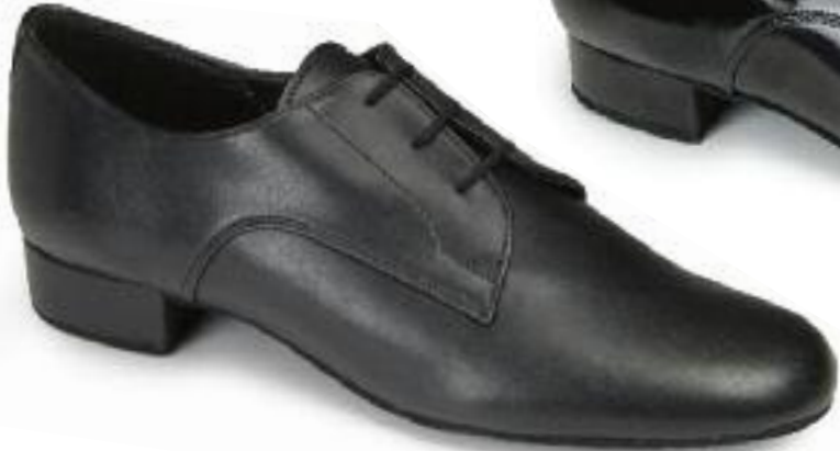
GIBSON BLACK CALF