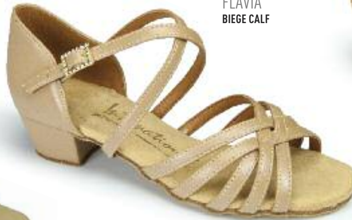
FLAVIA BIEGE CALF