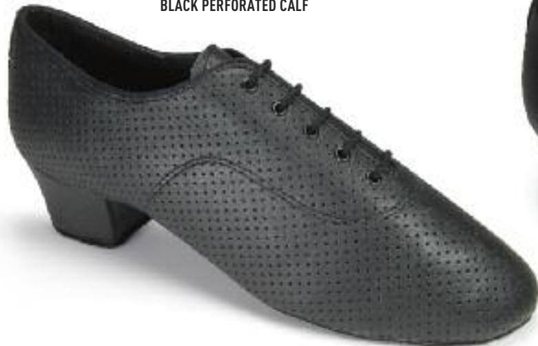
RUMBA BLACK PERFORATED CALF