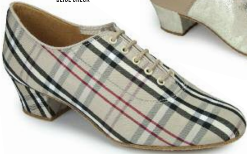
HEATHER BEIGE CHECK