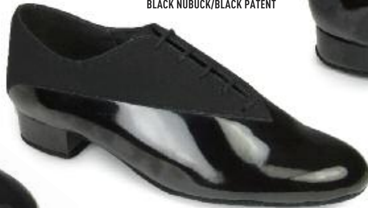
PINO BLACK NUBUCK/BLACK PATENT