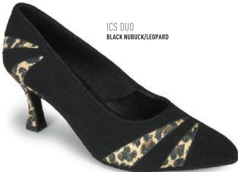
ICS DUO BLACK NUBUCK/LEOPARD