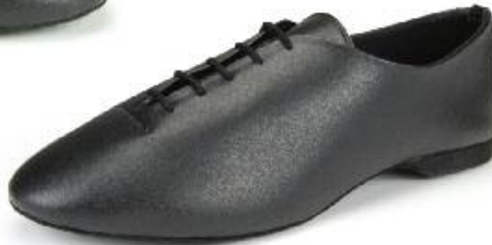
JAZZ SHOES BLACK CALF