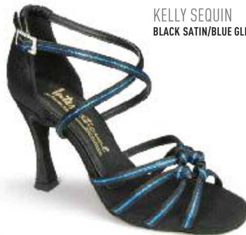
KELLY SEQUIN BLACK SATIN/BLUE GLITTER