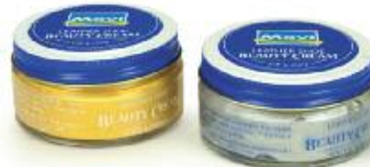
SHOE CREAM GOLD AND SILVER