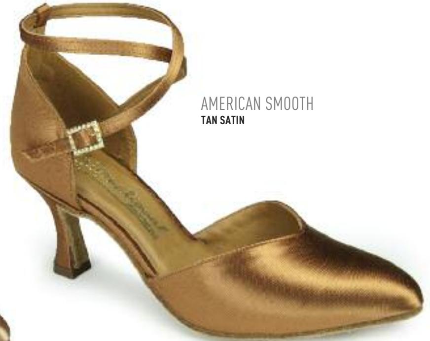
AMERICAN SMOOTH TAN SATIN