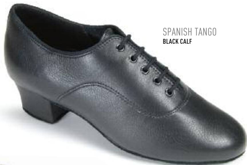
SPANISH TANGO BLACK CALF