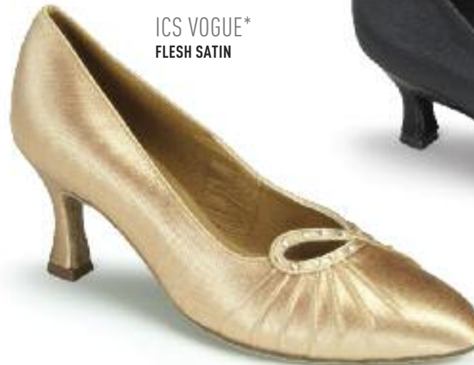
ICS VOGUE* FLESH SATIN