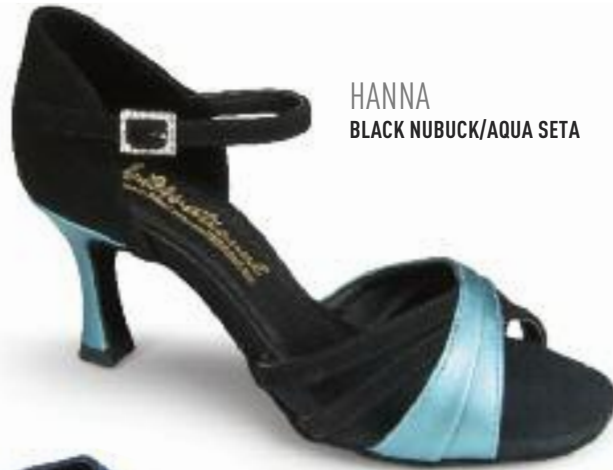
HANNA BLACK NUBUCK/AQUA SETA