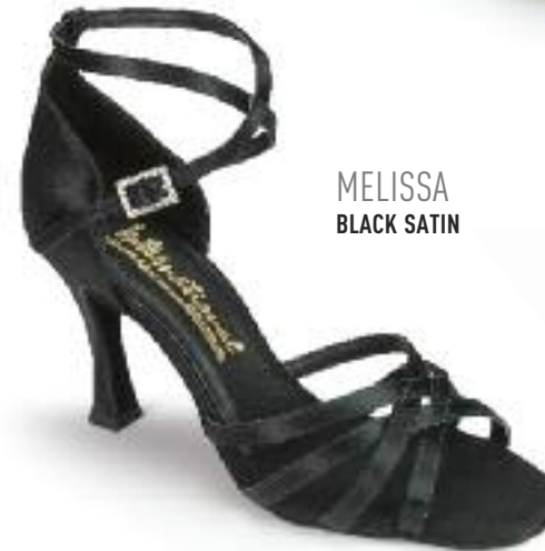
MELISSA BLACK SATIN