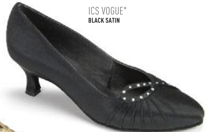
ICS VOGUE* BLACK SATIN

*ONLY AVAILABLE AS SEEN AND IN LIMITED STOCK