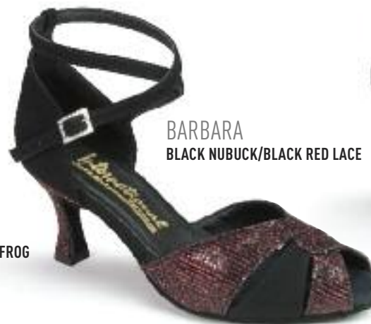
BARBARA BLACK NUBUCK/BLACK RED LACE