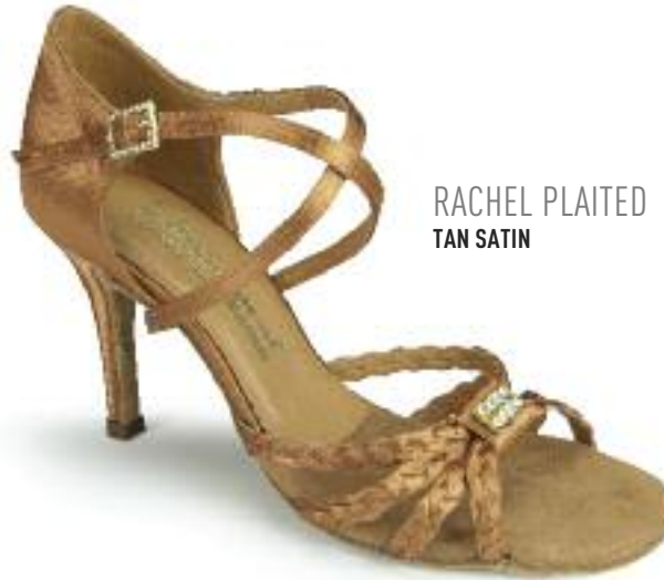
RACHEL PLAITED TAN SATIN