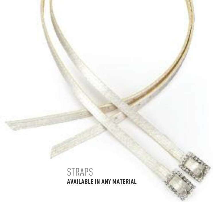
STRAPS AVAILABLE IN ANY MATERIAL