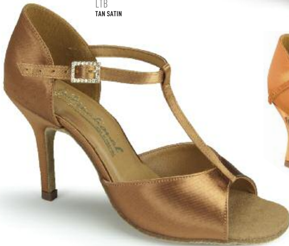
LTB TAN SATIN