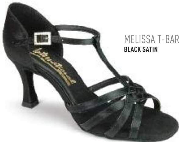
MELISSA T-BAR BLACK SATIN