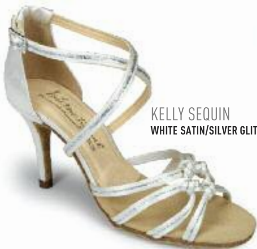
KELLY SEQUIN WHITE SATIN/SILVER GLITTER