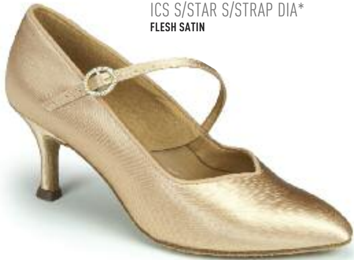
ICS S/STAR S/STRAP DIA* FLESH SATIN