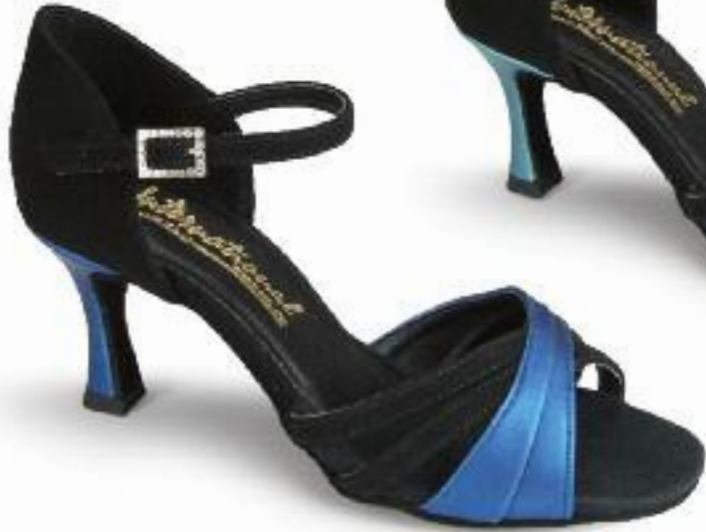
HANNA BLACK NUBUCK/BLUE SETA