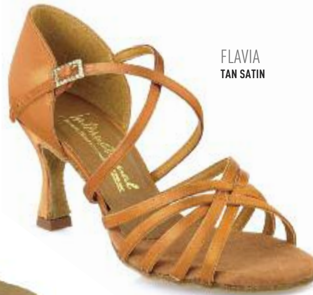
FLAVIA TAN SATIN