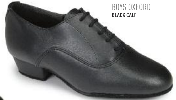
BOYS OXFORD BLACK CALF