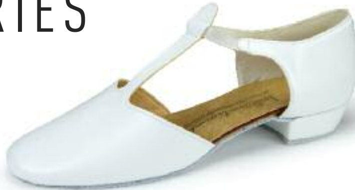
GREEK SANDALS WHITE CALF