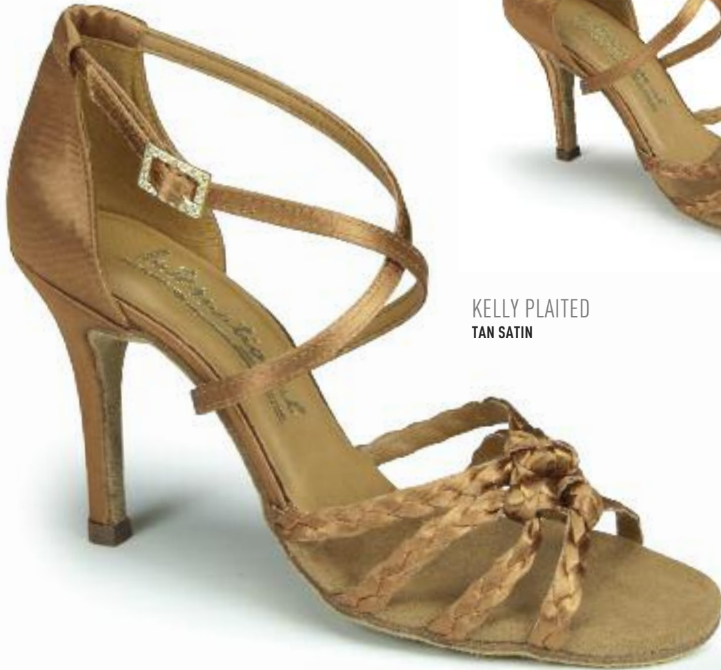
KELLY PLAITED TAN SATIN