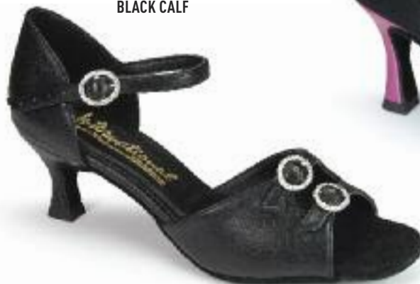
ASIA BLACK CALF