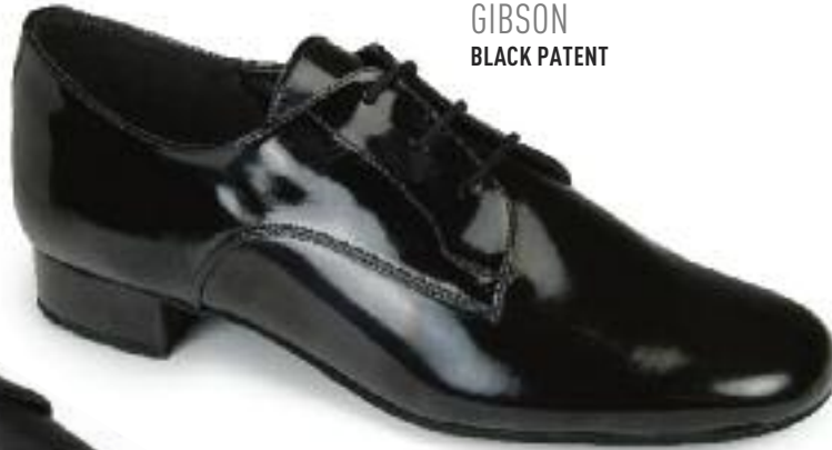
GIBSON BLACK PATENT