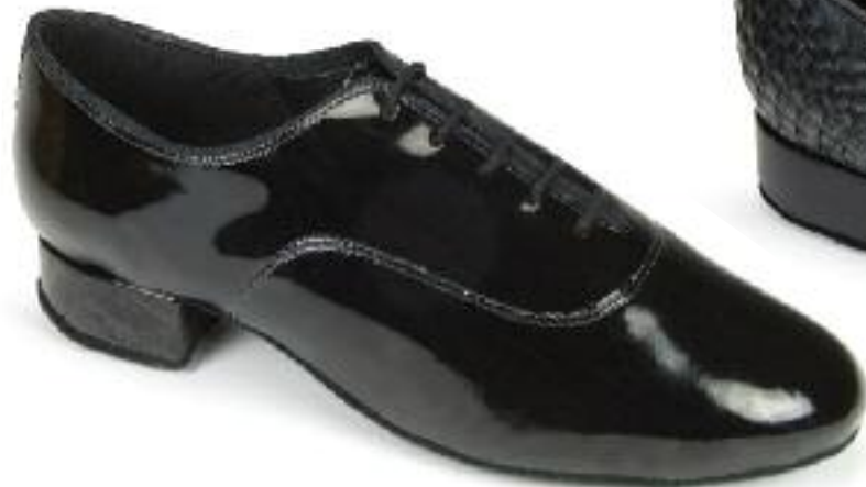
TANGO BLACK PATENT

WITH AIR HOLES TO THE SOLE, FOR INCREASED VENTILATION