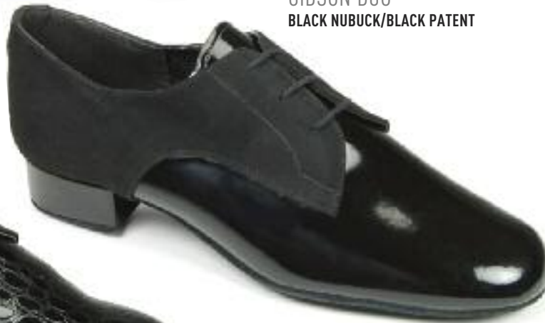
GIBSON DUO BLACK NUBUCK/BLACK PATENT