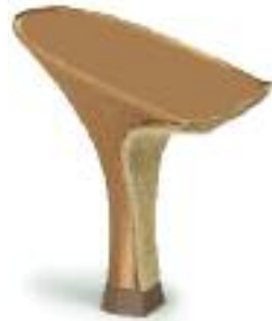
2½" ULTRA FLARED