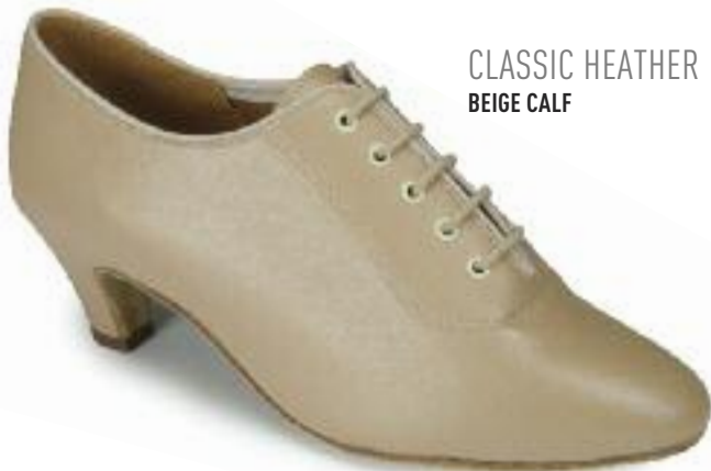
CLASSIC HEATHER BEIGE CALF