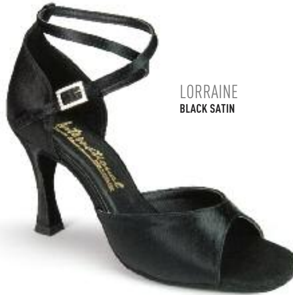
LORRAINE BLACK SATIN