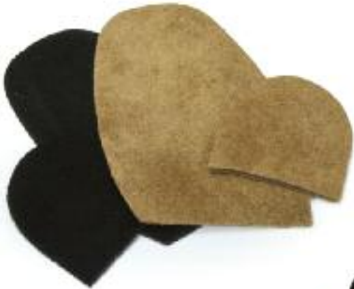
NON SKID SOLES FOR LADIES AND GENTS SHOES AVAILABLE IN BLACK, BEIGE AND GREY