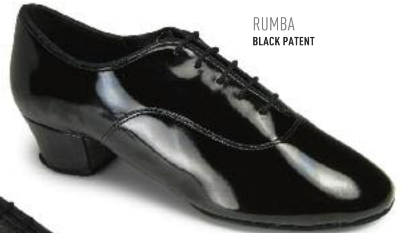
RUMBA BLACK PATENT