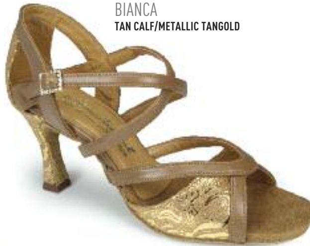
BIANCA TAN CALF/METALLIC TANGOLD