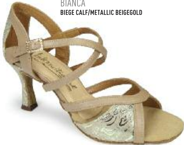
BIANCA BIEGE CALF/METALLIC BEIGEGOLD