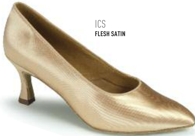
ICS FLESH SATIN