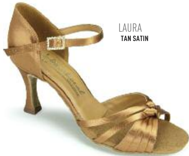
LAURA TAN SATIN