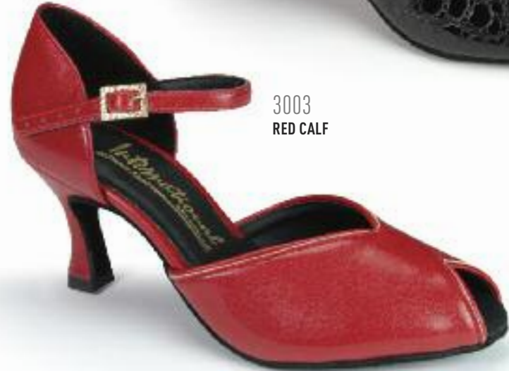
3003 RED CALF