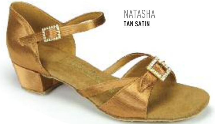
NATASHA TAN SATIN