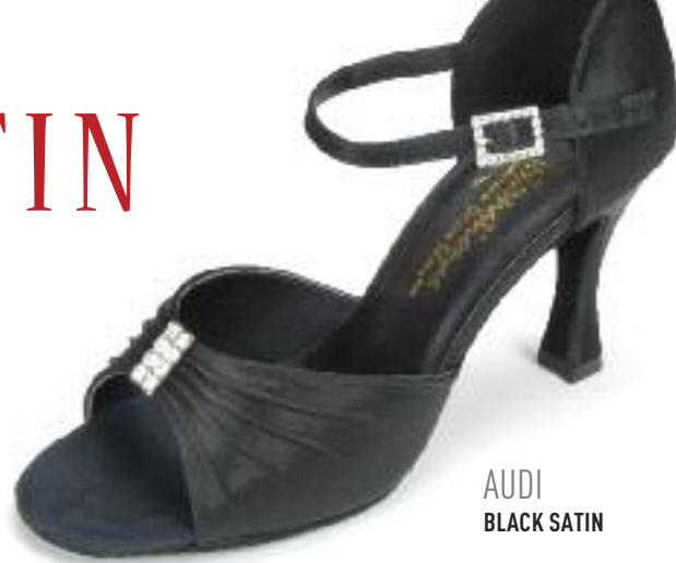
AUDI BLACK SATIN