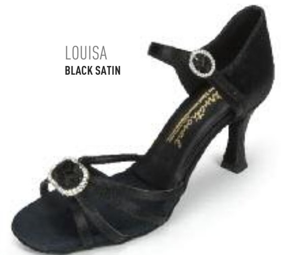
LOUISA BLACK SATIN