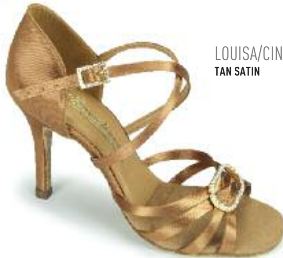
LOUISA/CINDY TAN SATIN