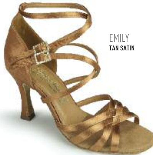
EMILY TAN SATIN