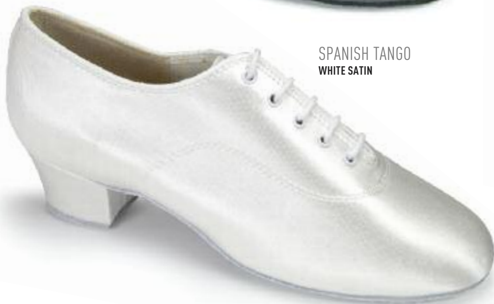
SPANISH TANGO WHITE SATIN