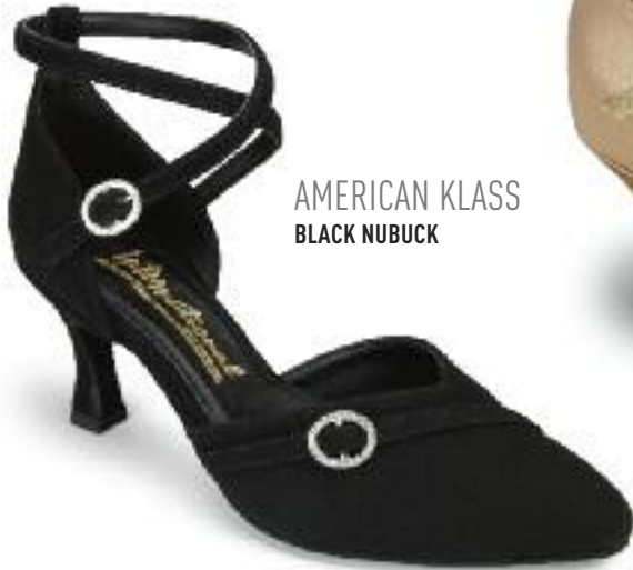
AMERICAN KLASS BLACK NUBUCK