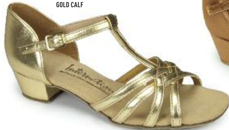
MELISSA T-BAR GOLD CALF