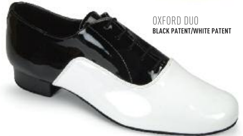
OXFORD DUO BLACK PATENT/WHITE PATENT