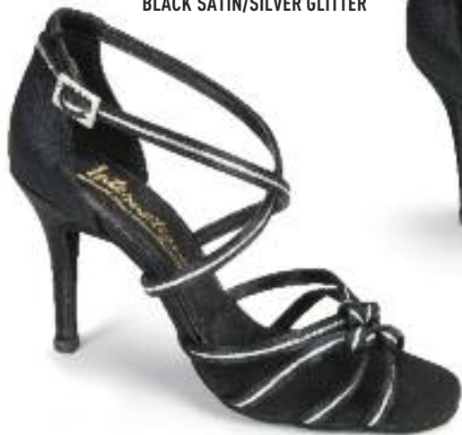
KELLY SEQUIN BLACK SATIN/SILVER GLITTER