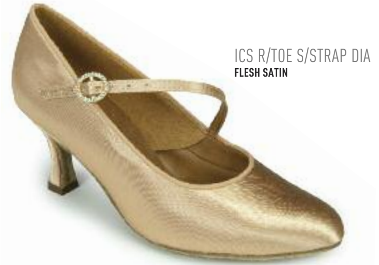
ICS R/TOE S/STRAP DIA FLESH SATIN