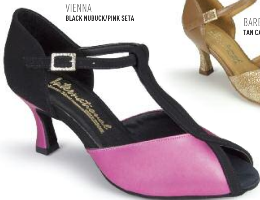
VIENNA BLACK NUBUCK/PINK SETA