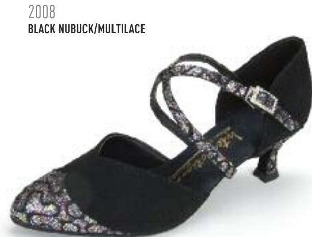
2008 BLACK NUBUCK/MULTILACE