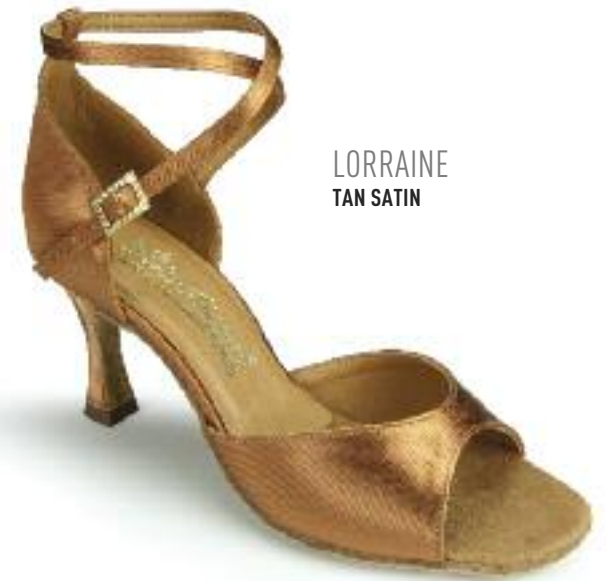
LORRAINE TAN SATIN