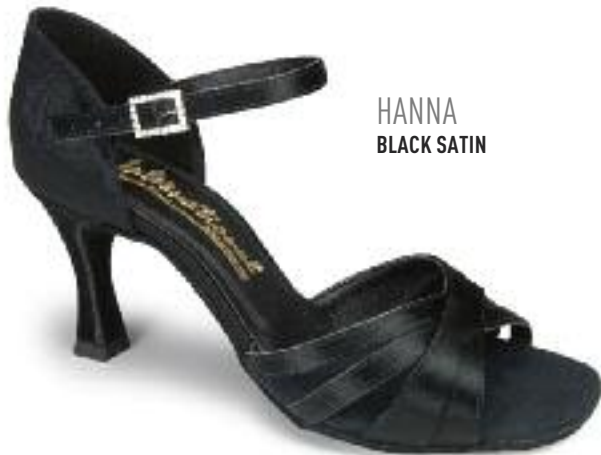
HANNA BLACK SATIN