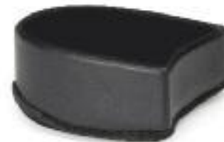
1" MENS HEEL