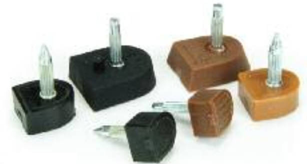
HEEL TIPS AVAILABLE FOR ALL LADIES HEELS

PLAIN PROTECTORS ARE AVAILABLE FOR ALL LADIES HEELS, SUEDE BASED PROTECTORS ARE AVAILABLE FOR 2" IDS AND 2 1/2" IDS HEELS ONLY