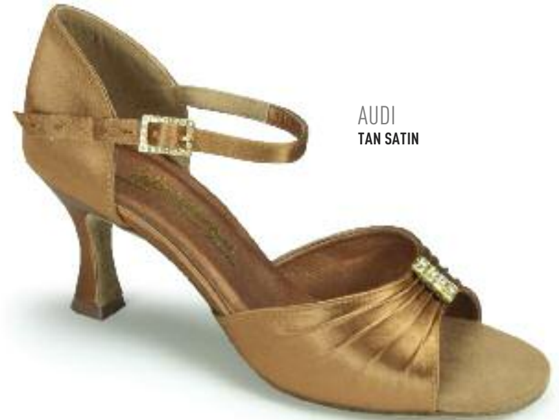
AUDI TAN SATIN