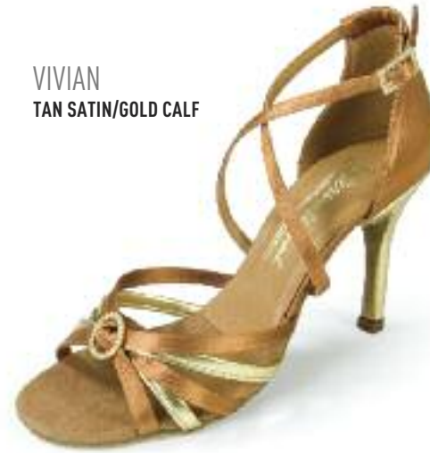
VIVIAN TAN SATIN/GOLD CALF