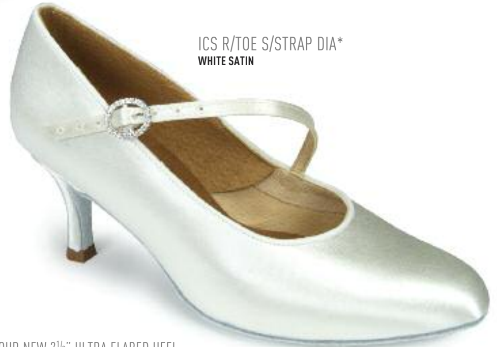
ICS R/TOE S/STRAP DIA* WHITE SATIN

*ALL STYLES NOW AVAILABLE WITH OUR NEW 2 1/2" ULTRA FLARED HEEL