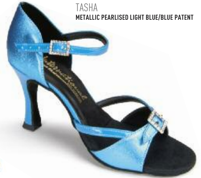
TASHA METALLIC PEARLISED LIGHT BLUE/BLUE PATENT