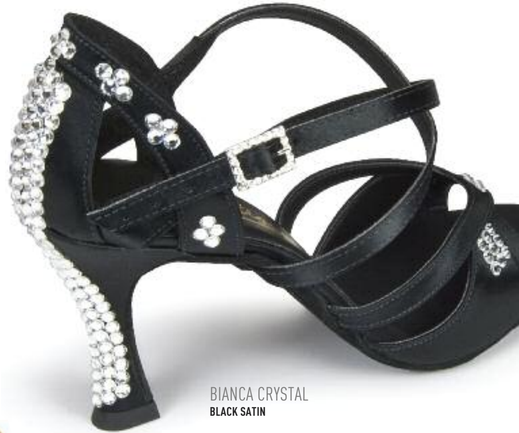
BIANCA CRYSTAL BLACK SATIN