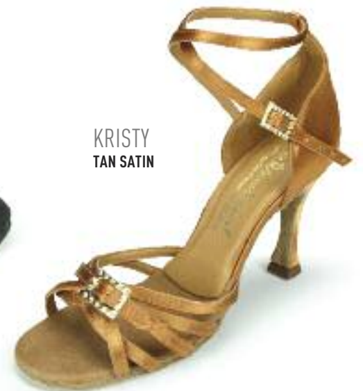
KRISTY TAN SATIN