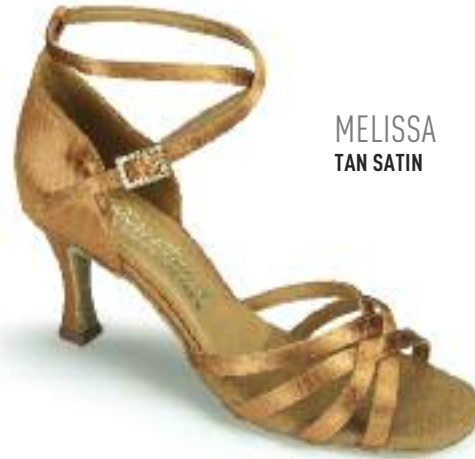
MELISSA TAN SATIN