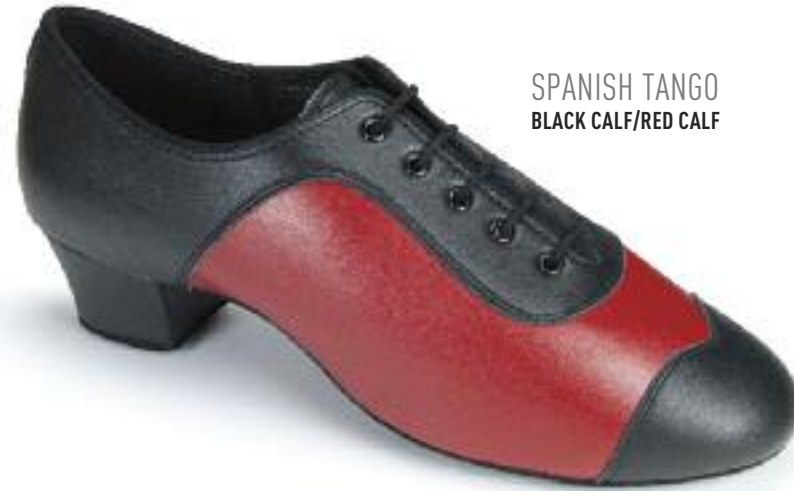
SPANISH TANGO BLACK CALF/RED CALF