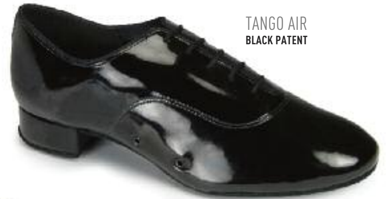
TANGO AIR BLACK PATENT

WITH AIR HOLES TO THE SOLE, FOR INCREASED VENTILATION