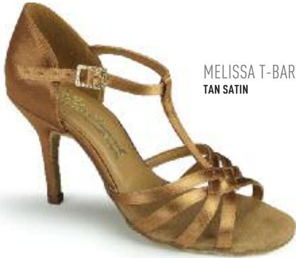
MELISSA T-BAR TAN SATIN