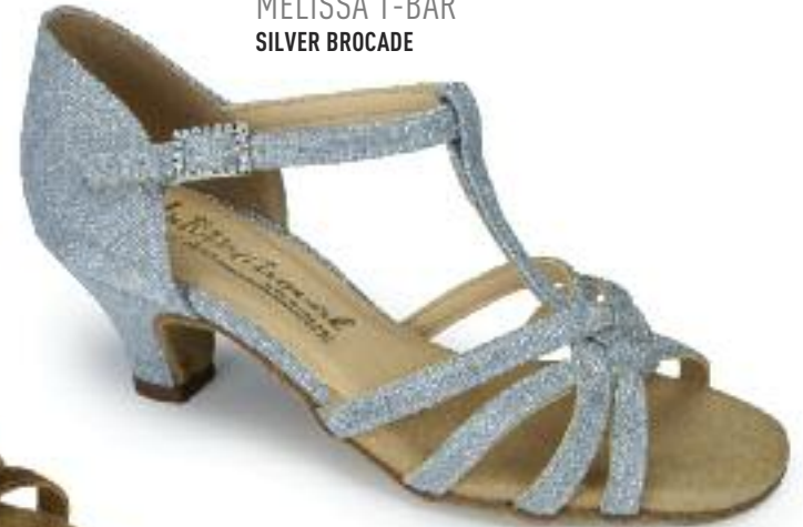
MELISSA T-BAR SILVER BROCADE