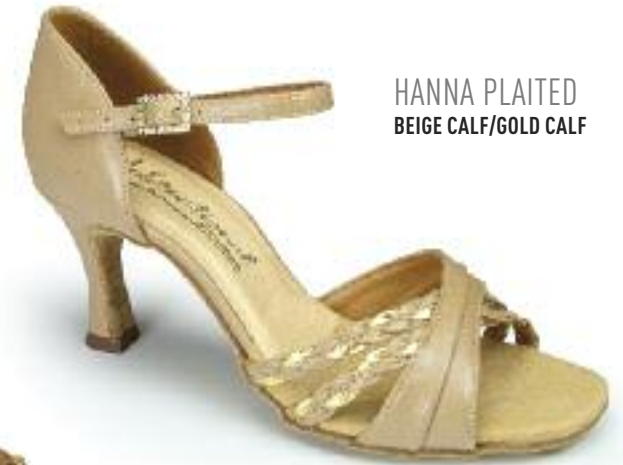
HANNA PLAITED BEIGE CALF/GOLD CALF