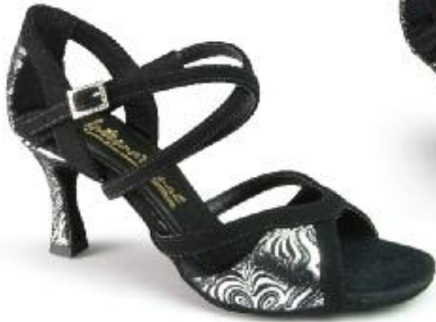
BIANCA BLACK NUBUCK/METALLIC BLACKSILVER