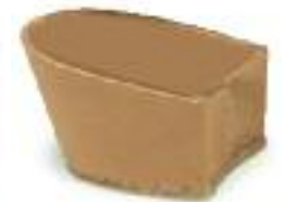
1¼" GIRLS CUBAN