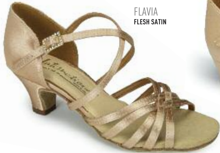
FLAVIA FLESH SATIN