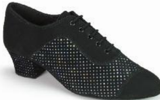
CK LINE BLACK NUBUCK/BLACK SILVER HOLOGRAM