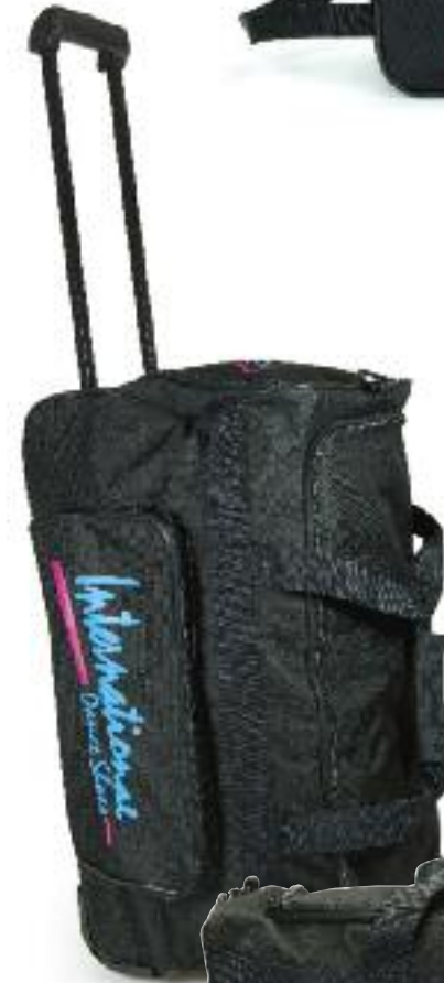
WHEELED SPORTS BAG WITH SHOE COMPARTMENT