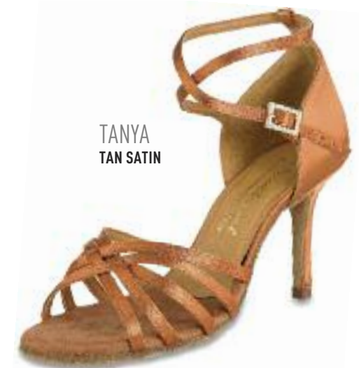
TANYA TAN SATIN