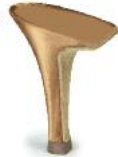
2½" ULTRA SLIM