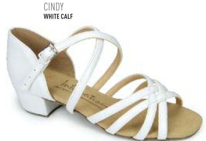
CINDY WHITE CALF