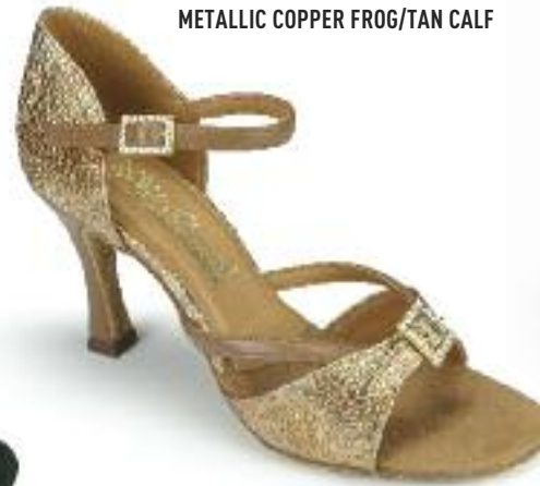
TASHA METALLIC COPPER FROG/TAN CALF