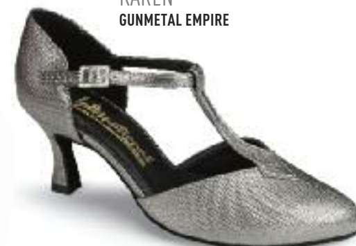
KAREN GUNMETAL EMPIRE